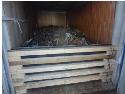
Figure 7.55 CTU with wall liners and door barrier loaded with scrap