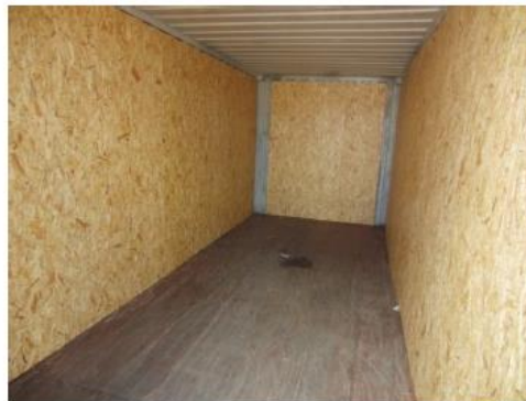
Figure 7.53 Lining a 40-foot container with chipboard panels